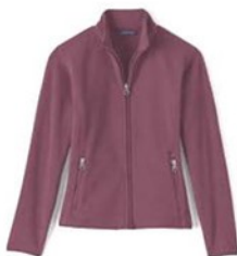
Burgundy Fleece Jacket with Zipper