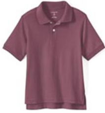
Burgundy Polo with Logo (available in long sleeve)