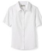
White No Gape Blouse with Logo (long sleeve optional)