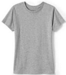
Gray T-Shirt with Lion Logo (available in long sleeve)