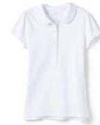
Short Sleeve Peter Pan Polo with School Logo (long sleeve optional)