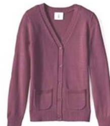
Burgundy Cardigan with Buttons