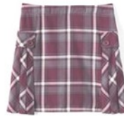
Skort (same as informal)