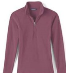
Burgundy Fleece Jacket with Quarter Zipper