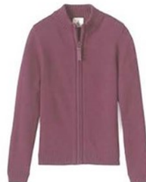
Burgundy Cardigan with Zipper