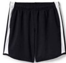
Athletic Shorts with Lion Logo (available in long pants)

Sneakers Solid white, black, gray or combination of these colors With white socks